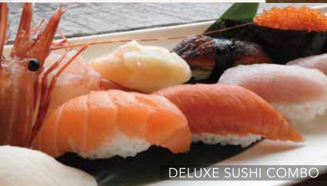
DELUXE SUSHI COMBO