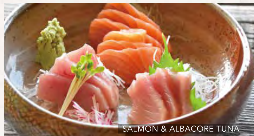
SALMON & ALBACORE TUNA