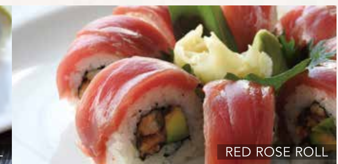
RED ROSE ROLL