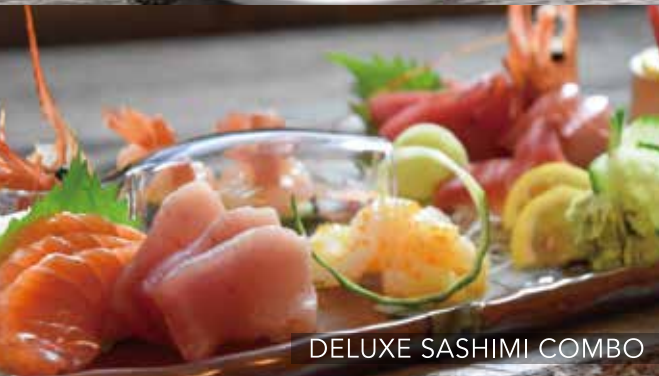
DELUXE SASHIMI COMBO