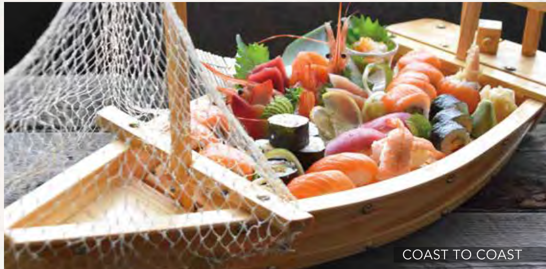
COAST TO COAST

6 pieces of nigiri, 12 pieces of sashimi, and 16 pieces of special rolls served on a wooden boat.