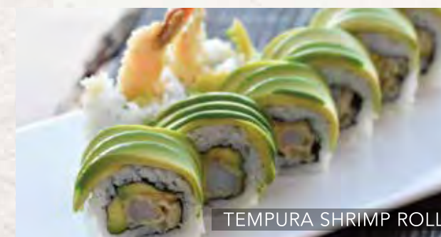
TEMPURA SHRIMP ROLL

Avocado in the inside, wrapped with avocado. Made especially for the avocado lovers.