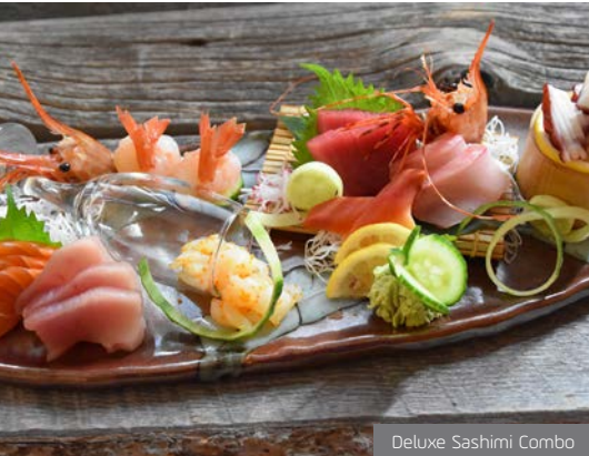
Deluxe Sashimi Combo