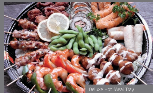
Deluxe Hot Meal Tray

Please order the above party trays 24 hours in advance. No substitutions.