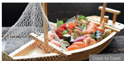
Coast to Coast

Please order the above party trays 24 hours in advance. No substitutions.