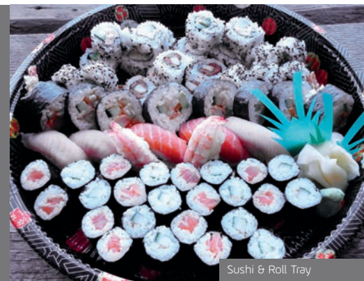
Sushi & Roll Tray