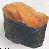
UNI 4 Sea urchin