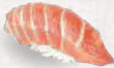
SAKE 2 1/4 Salmon