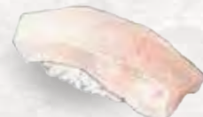
HAMACHI 3 Yellowtail