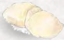
HOTATE 3 Scallop