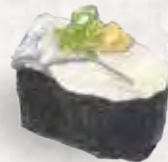
KAKI 4 Fresh oyster