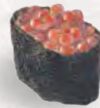
IKURA 3 ½ Salmon roe