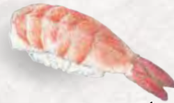
EBI 2 1/4 Shrimp