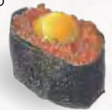
UZURA ¾ Quail egg