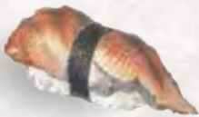
UNAGI 3 1/2 Eel