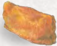
INARI 2 Fried soybean curd