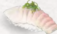
TORO 3 Tuna belly