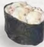
CHOP CHOP 2 ½ Scallop with tobiko and mayo