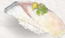
SABA 2 Mackerel