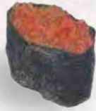
TOBIKO 2 ½ Flying fish roe