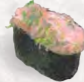
NEGI-TORO 3 Chopped tuna belly