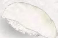
IKA 2 1/2 Squid