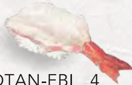
BOTAN-EBI 4 Spot prawn