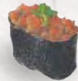
SPICY TUNA 2 ½