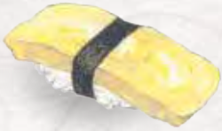
TAMAGO 2 Omelet