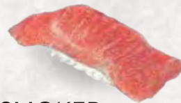
SMOKED SALMON 2 1/2