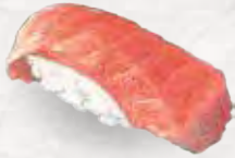
BENI-SAKE 2 1/2 Sockeye salmon