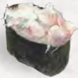
KANI 2 ½ Real crab