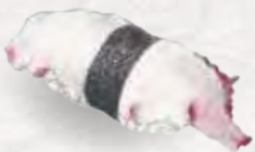
TAKO 3 Octopus