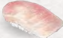
BINCHO-MAGURO 2 1/4 Albacore tuna