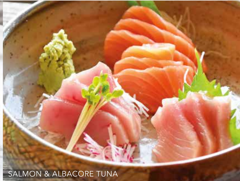
SALMON & ALBACORE TUNA