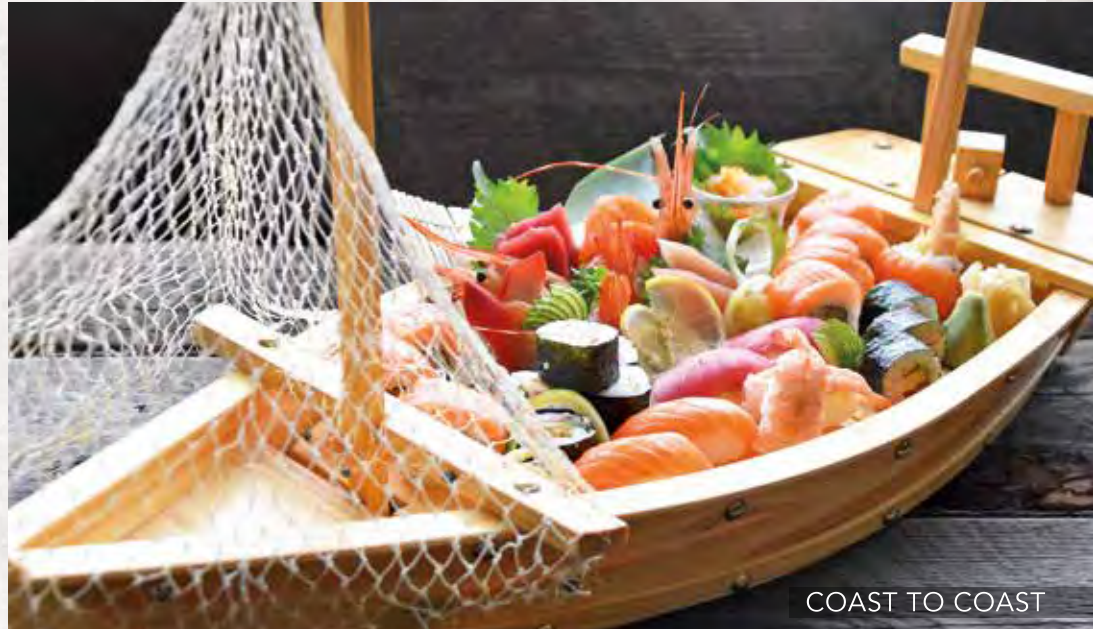
COAST TO COAST

6 pieces of nigiri, 12 pieces of sashimi, and 16 pieces of special rolls served on a wooden boat.