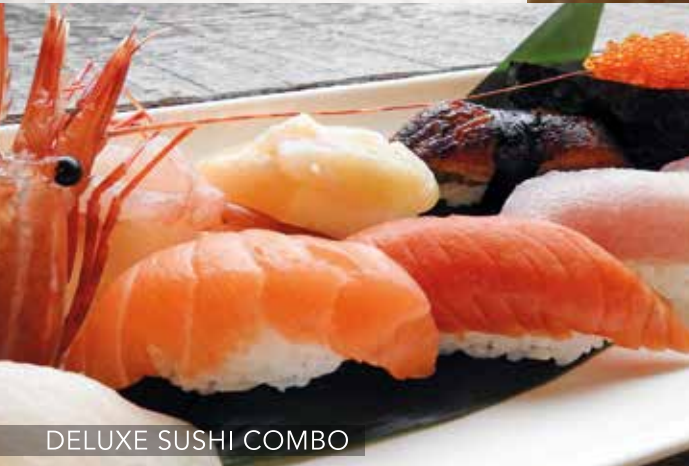
DELUXE SUSHI COMBO