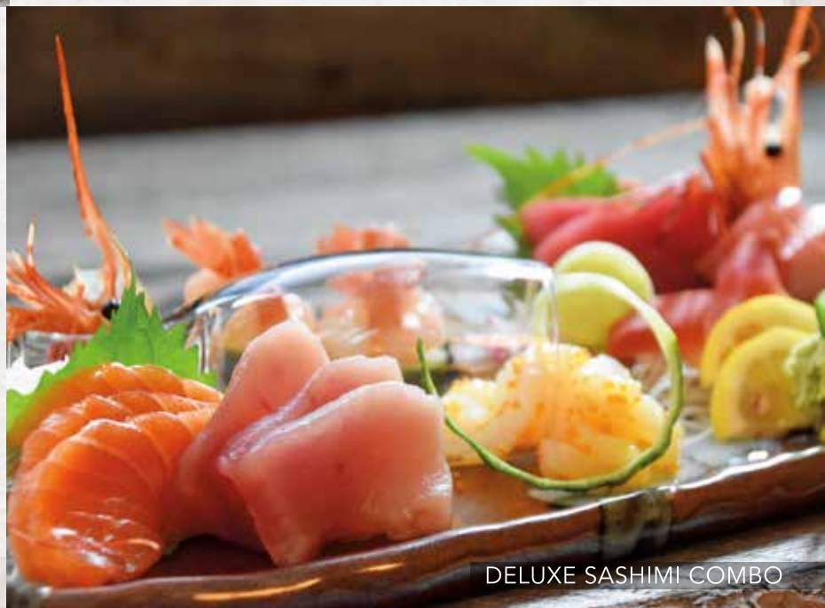
DELUXE SASHIMI COMBO

6 types of chef's choice fine cut fresh fish.