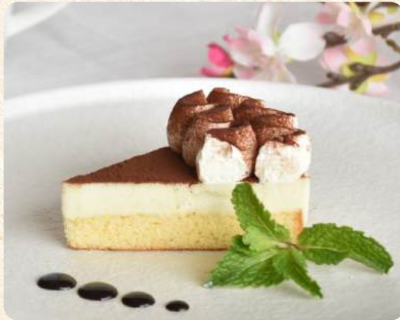
Sweet Potato Cake 9