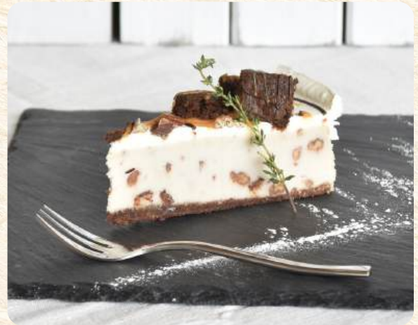
Turtle Cheesecake (GLUTEN-FREE) 12