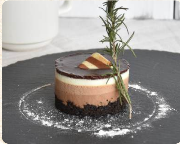
Triple Chocolate Mousse 11