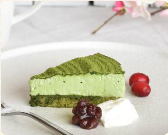
Matcha Tiramisu 9